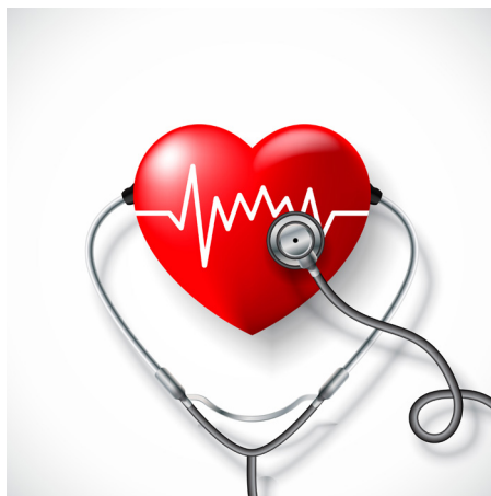
HEART HEALTH VECTORS BY VECTEEZY

We propose this term to describe what the standard of care currently calls "secondary prevention," i.e. patients who have already experienced one or more CV events.