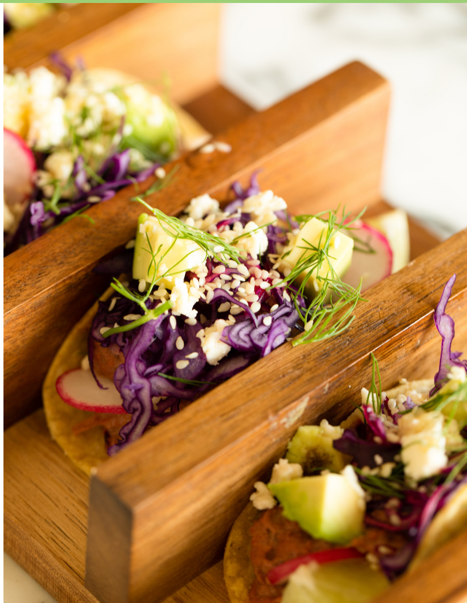
Recipe adapted from Feasting at home and alecooks blogs.