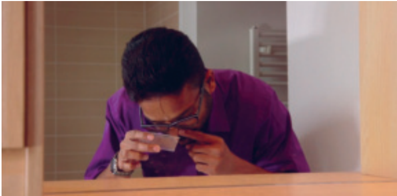
Photo: Nasal irrigation and gargling (from the ELVIS study video, used with permission).

It is unclear if hypertonic saline nasal irrigation and gargling is also effective in COVID-19 caused by SARS-CoV-2; a trial is therefore urgently needed.